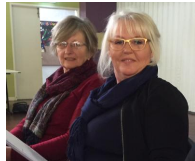
NCWWA Members at the July General Meeting

The WA men's health and well being policy recently closed for consultation - there are a number of issues with this policy including that the document doesn't note that men are the majority of victims of violence, and also the majority of perpetrators- and consequently doesn't offer any preventive health responses to assist these men which will help avoid the costs to women in these health behaviours.